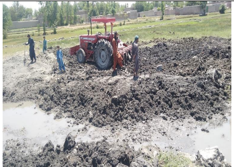
Figer2: During field visit observed the ploughing by Tractor in Nangarhar Province