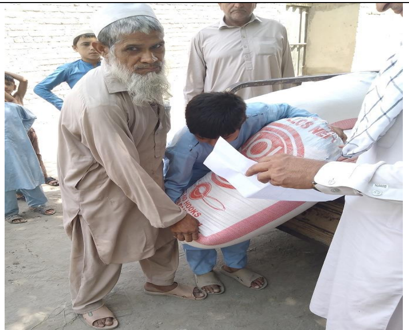
Figer1: Distribution of Animal Feed .