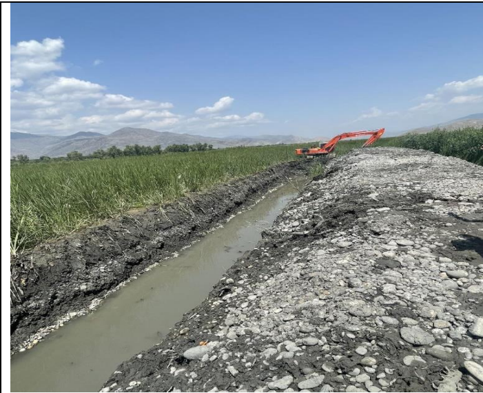
Figer1:Excavition of Wetland in Nangarhar Province