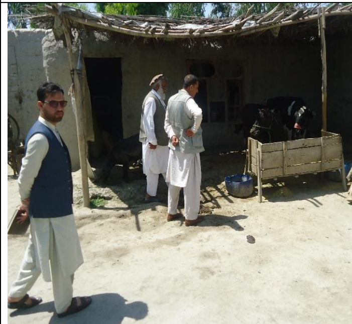
Figer1: Beneficiaries selection for Animal Feed.