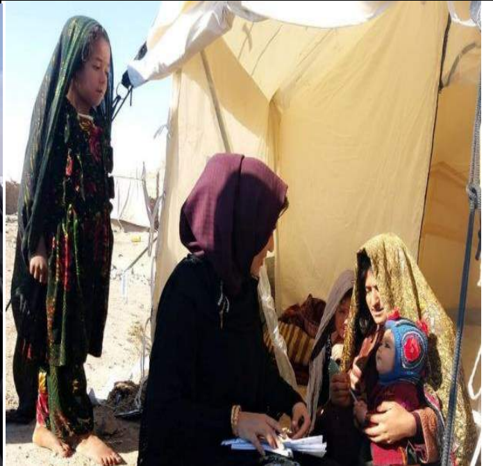
beneficiaries received emergency shelter in Injil district