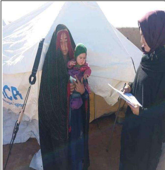
beneficiary received emergency shelter in Guzara district

this token will help distribution staff for well knowing the beneficiary. NCRO will participate in all humanitarian response coordination meetings, cluster meetings at national and regional levels. Sharing of project MoU after signing and officially informing the Ministry of Economic and MoRR in Kabul and line departments in the province level and relevant districts government. NCRO will provide technical support to the beneficiaries. NCRO will report through Report Hup to OCHA and cluster