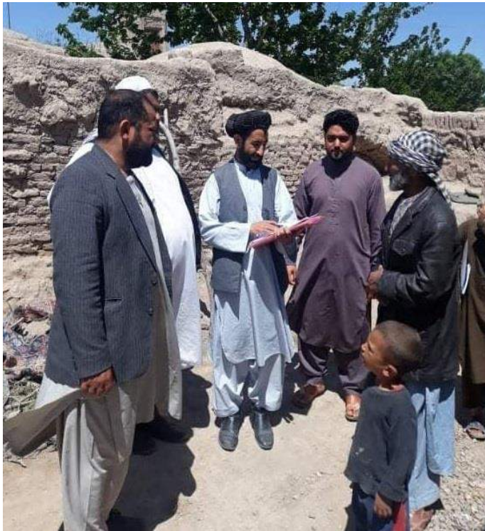
Training of 1050 families in hygiene awareness rising in Tolak

In total 6 wells equipped with solar and pipe scheme as explained above constructed and 2000 families received hygiene awareness training in Dawlatyar and Tulak districts .