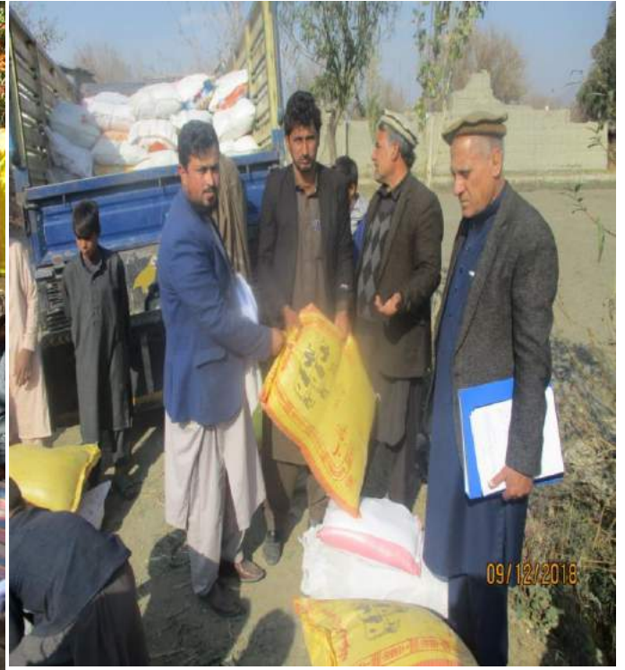
seed distribution in laghman mehtarlam