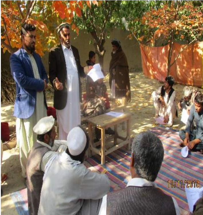
Training for coordination in laghman Qargai