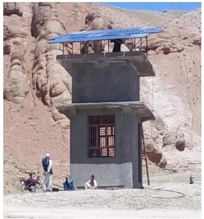
Construction of equipped with solar power water pump, in Tolak