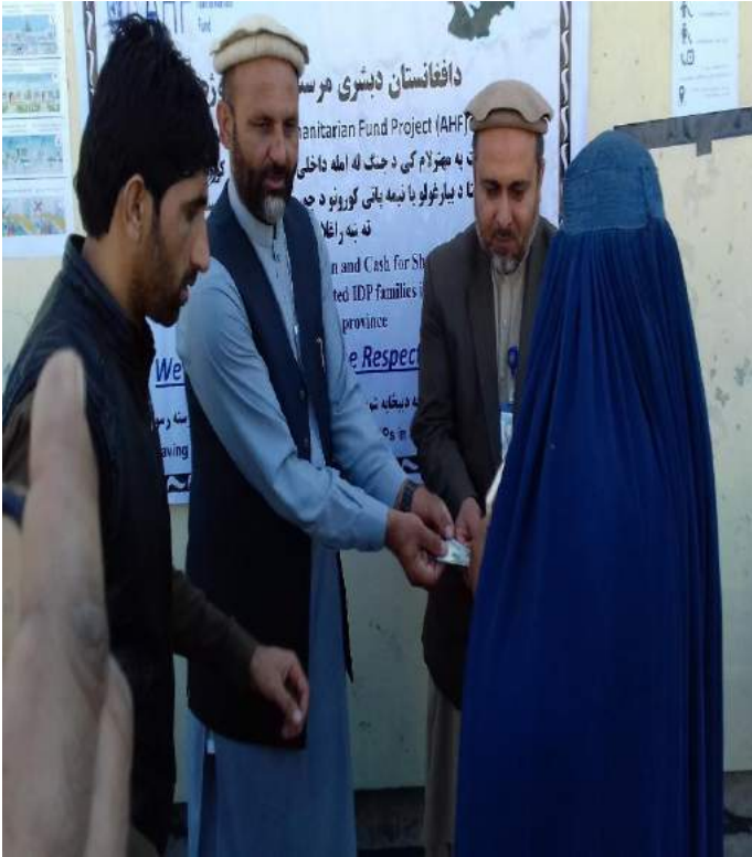
Assisted beneficiaries of cash for food in Laghman