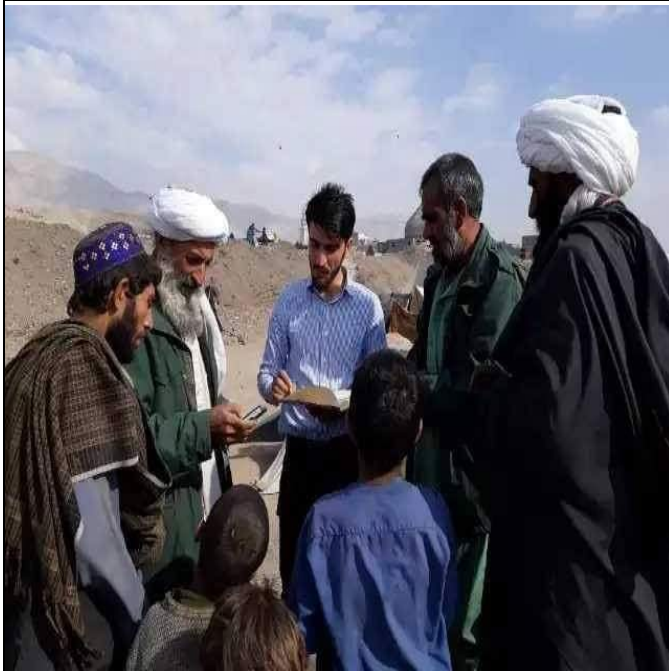
beneficiaries received cash based assistance for ES/NFI cluster standard NFI package in Guzara district of Hirat