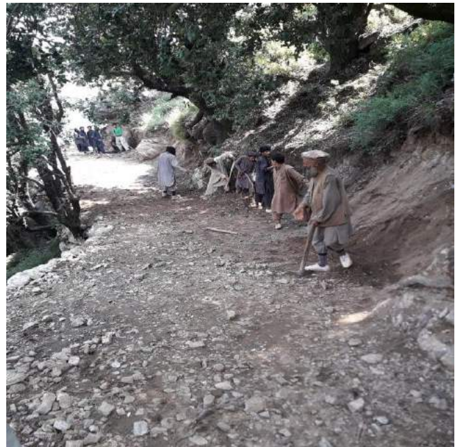
Labours working for construction of Gadogli Rood of Shigal under WFP Asset Creation program