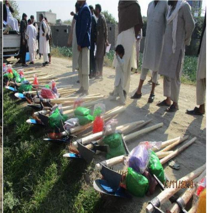
tool distribution in laghman Qarghai