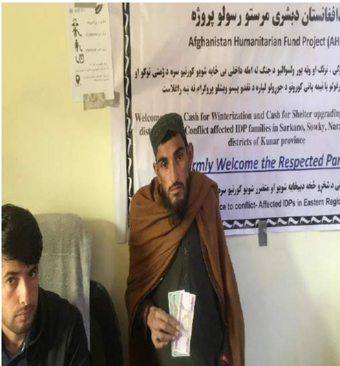
Assisted beneficiaries of cash for food in Kunar province