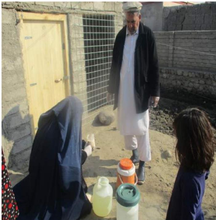
Poultry distribution in Laghman mehtarlam