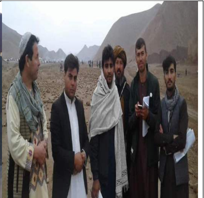
beneficiaries received cash based assistance for ES/NFI cluster standard Winterization package in Injil