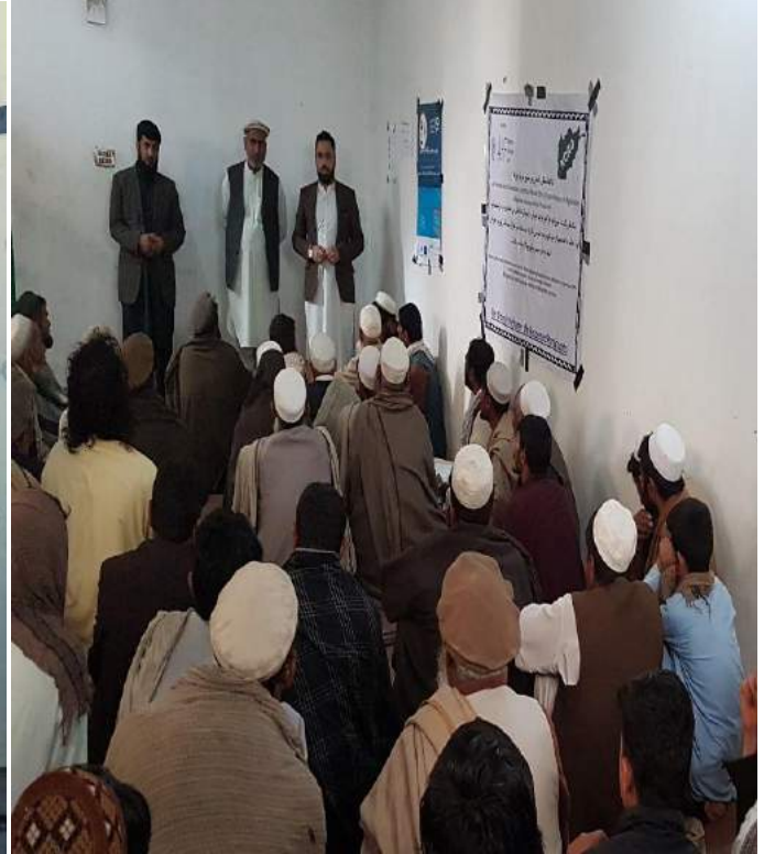
Assisted beneficiaries of cash for Agricultural in Nangarhar